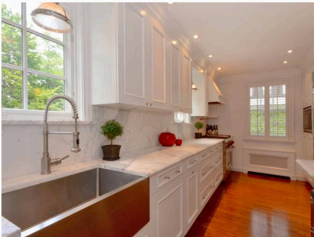
The original kitchen was a dark, galley kitchen with a dropped ceiling. Baxter opened the space by two feet by utilizing two large closets in the hallway behind it.